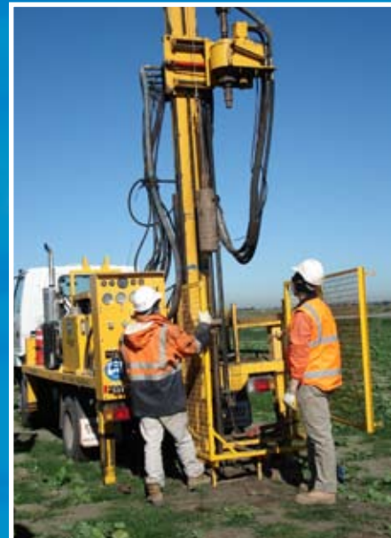
→ Testing of the biosolids stockpile area at the Western Treatment Plant.

"All these materials would alternatively end up in landfill or not be used in a sustainable manner. We're looking at optimising them and using them in engineering applications."